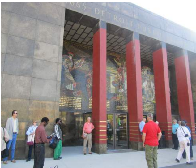
ECHRS members toured the Detroit Library this September.