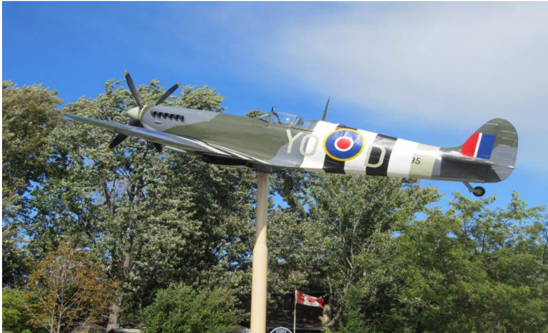
The Spitfire tribute to Jerry Billings is now up in Essex.